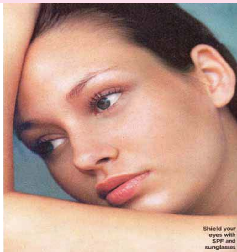
Shield your eyes with SPF and sunglasses

EXPERT STRATEGY Using retinoids and wearing sunscreen will slow the development of crow's-feet, and applying a hydrating cream will plump the area so they're less prominent. The bottom line If creasing is still bothering you, consult a dermatologist about Botox Cosmetic. "It typically takes three to five small injections to relax the muscles so that wrinkles aren't as visible," says Elie Levine, M.D. The cost: $250 to $500 per session for results that last four to six months.